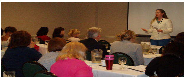
Classrooms are sized to provide personal interaction with speakers.