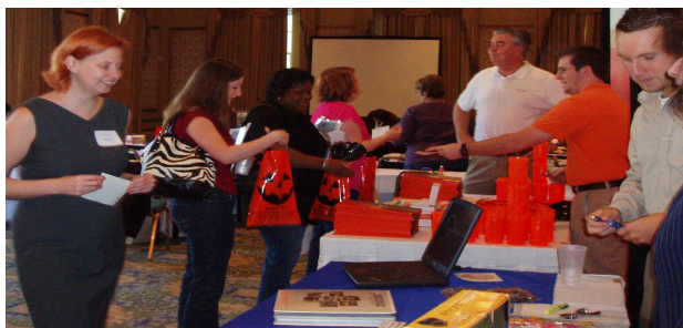
Paralegals enhance their careers by staying current with the latest information and technology available.

NOPA established longer breaks between sessions to allow time for paralegals to visit vendor booths. Vendors provide paralegals with the tools of their trade and also educate them regarding the latest state of the art technology in e-discovery and trial preparation. Seminar attendees are encouraged to network, exchange knowledge and discuss solutions with their fellow paralegals in order to improve job efficiency and performance.